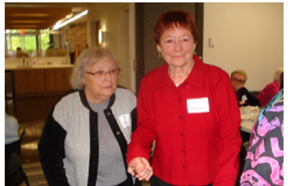
Founder's Day Weekend, September 24-26 See the UMMRA Web site for identifications